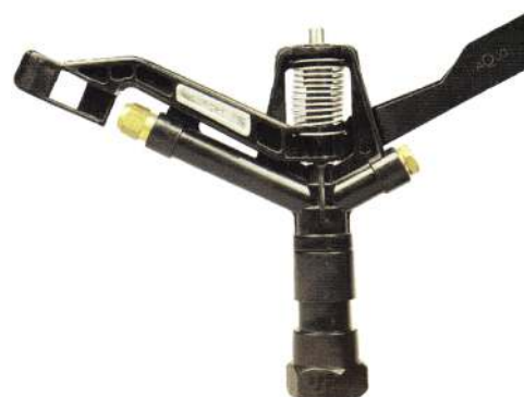
With Brass Nozzle