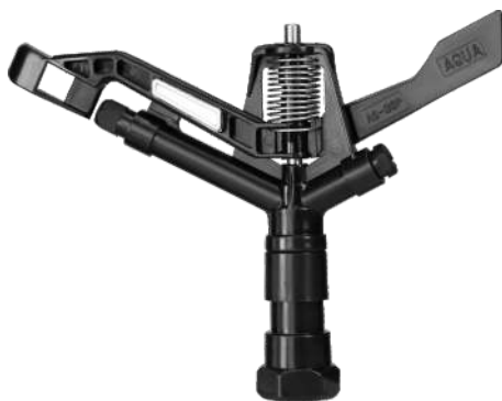
With Plastic Nozzle